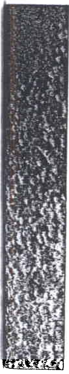
BUSTED - This Town of Garner sprinkler system was used last week to water flowers, in violation of the voluntary conservation measures adopted by the city of Raleigh on June 26. Town manager Mary Lou Rand then ordered the sprinkler shut down.

ues department, in response to continued drought conditions brought on by a lack of rainfall to the area, adopted mandatory conservation measures during a June 26 meeting.